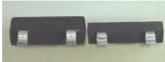
Figure 3. Comparison of Present and New Packages